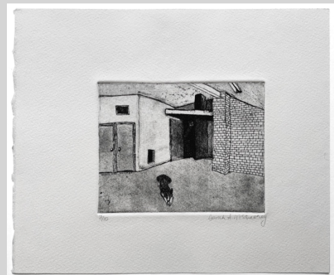
Studio , 1985 Sheet: 8 7/8 x 10 1/2 in. (22.5 x 26.7 cm) Edition of 10 Soft-ground etching $450