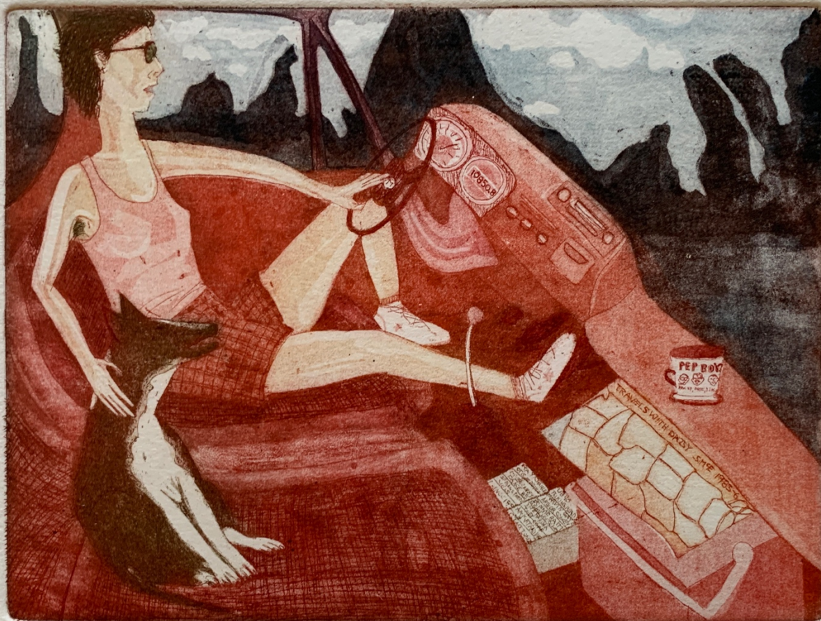
Travels with Daisy , 1986 Sheet: 7 1/8 x 9 1/8 in. (18.1 x 23.2 cm) Color soft-ground etching $750