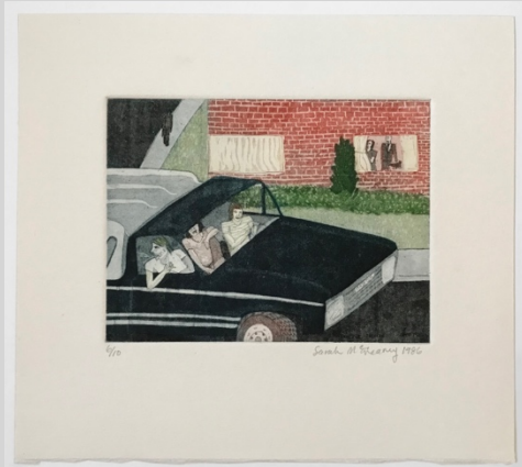
Seattle Joyride , 1986 Sheet: 10 1/2 x 12 in. (26.7 x 30.5 cm) Edition of 10 Color soft-ground etching $600