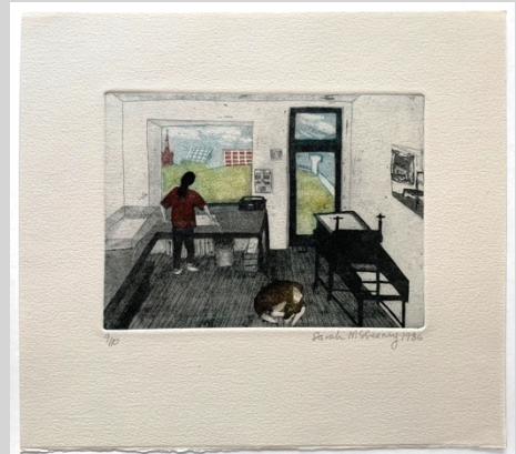
CRE , 1986 Sheet: 10 3/4 x 12 in. (27.3 x 30.5 cm) Edition of 10 Color soft-ground etching $750