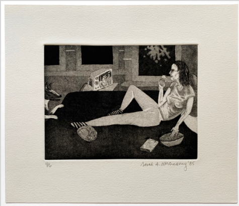
Bedroom Two , 1985 Sheet: 10 x 11 3/4 in. (25.4 x 29.9 cm) Edition of 6 Soft-ground etching $500