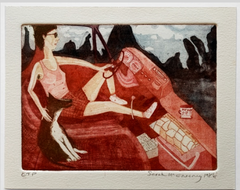
Travels with Daisy , 1986 Sheet: 7 1/8 x 9 1/8 in. (18.1 x 23.2 cm) Color soft-ground etching $750